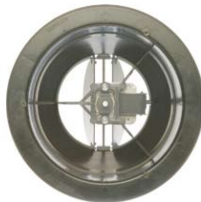
DraftStoppa® TopHat™ (view from underneath) OPEN

DraftStoppa® TopHat™ - The totally self-sealing, energy-efficient exhaust fan.