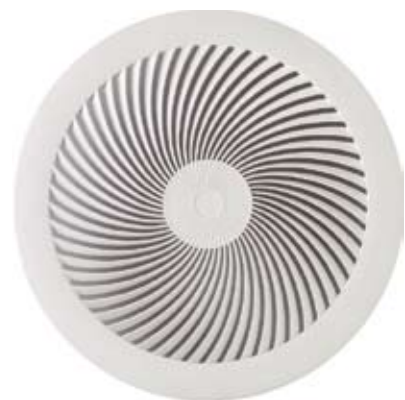
Revolutionary VorTecs™ Grille