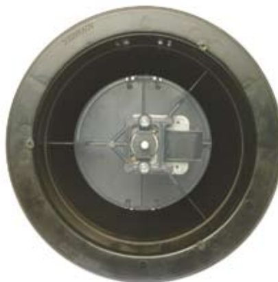
DraftStoppa® TopHat™ (view from underneath) CLOSED